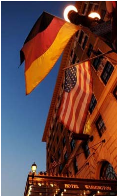
German and American flags in Washington near the White House on June 6, 2011.

This year marks the 25th anniversary of German-American Day, observed annually on October 6 to celebrate German-American heritage in the United States.