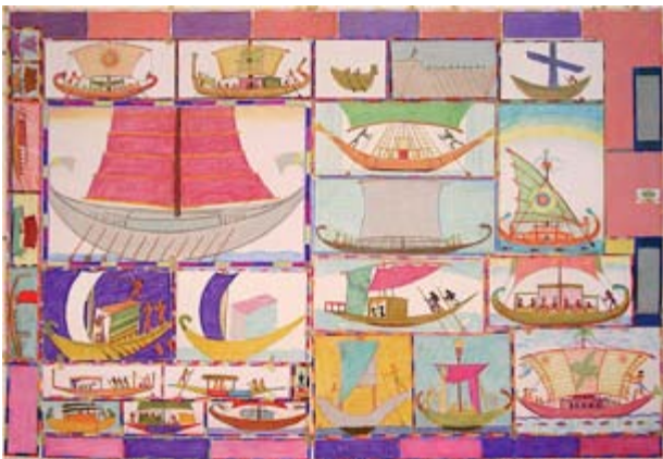
The Ship of Siva, 2008 (From The Ship of Tolerance) Silkscreen on Canvas. Edition of 20, A/P 4. 80 x 107 1/2 inches